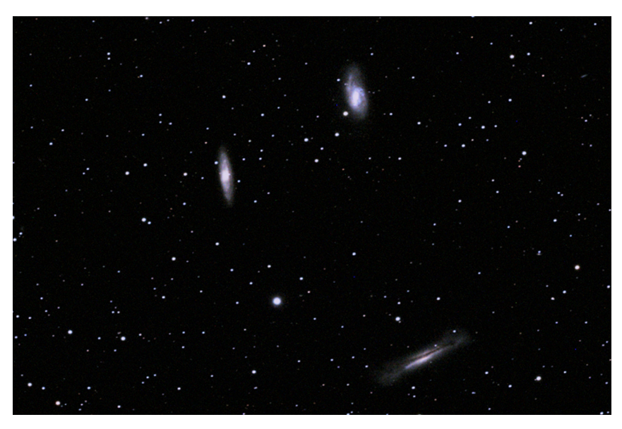
Leo Trio (M65, M66 and NGC 3628 - 5 min exposure with Canon XTi)

M97, the Owl Nebula in the Big Dipper, has always managed to elude visual detection from my vantage point in north-central NJ. Even without averted vision, this well known planetary nebula exhibited a ghostly greenish countenance with two darkened eyes through the RC optical train. NGC 4361, a similarly challenging PN located in Corvus, required a little more effort and averted vision to see. Galaxies such as the Whirlpool (M51) in CVn, M64 ("Black Eye") in Com, and the Leo Trio (M65, M66 and NGC 3628) were all clearly defined and showing, as appropriate, dust lanes and/or spiral structure.