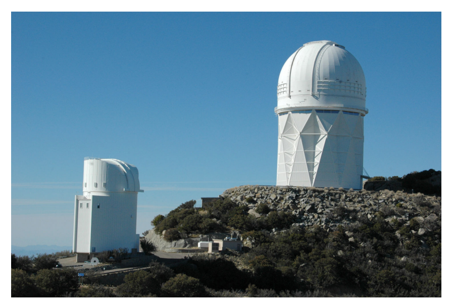
Mayall 4-meter Telescope