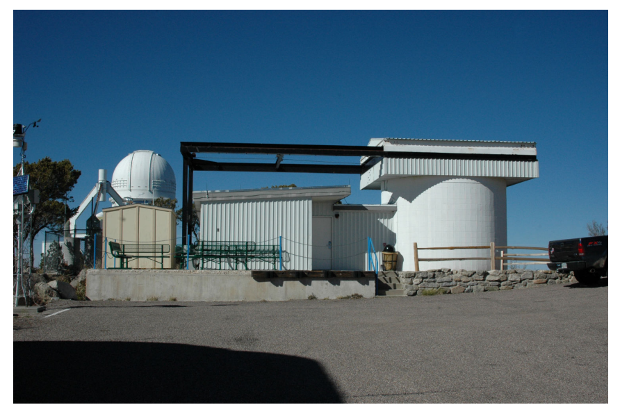
Roll-off Observatory at Kitt Peak Housing RC 16R & TEK 140

exclusive access to an optical instrument. We arrived around 2 PM on March 4<sup>th</sup> whereupon we were assigned a personal guide (Roy Lorenz) and telescope system for use after the public nightime observing program finished (~10:30 PM). Following a fairly decent dinner in their cafeteria we watched a magnificent sunset and then retired to our room until 10 PM. Out telescope system for the evening was housed in a roll-off roof observatory and consisted of a first-rate collection of optics. Both instruments, a TEK 140 mm f/7 apochromatic refractor and a 16" carbon truss Ritchey-Chrétien from