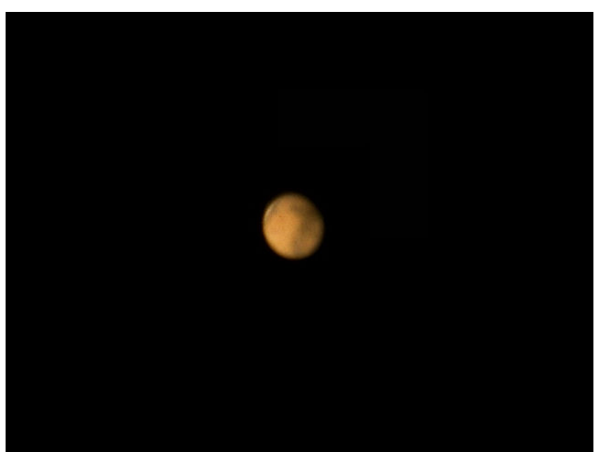
Mars from Kitt Peak, AZ (04March08)

some avi images taken of Mars and Jupiter through a color videocam by another AOP couple in a nearby domed system. Surface details and the polar cap on Mars were clearly evident even though the apparent diameter of this planet is presently less than 9 arc-sec.